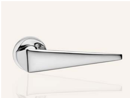
CR cromo lucido polished chrome