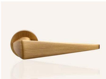
PM patiné patiné mat