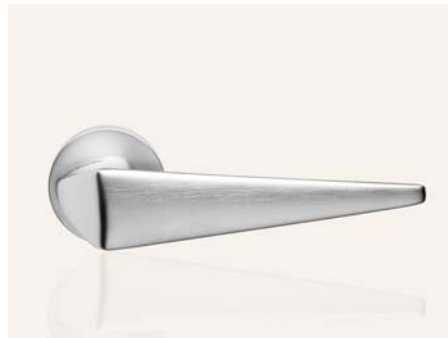
CS cromo satinato satin chrome