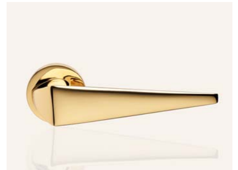
OZ oro zecchino gold plated